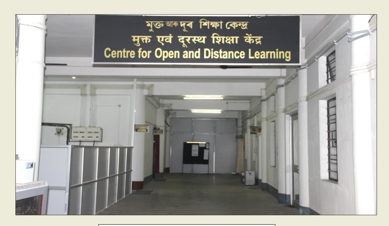
Inside view of CODL premises