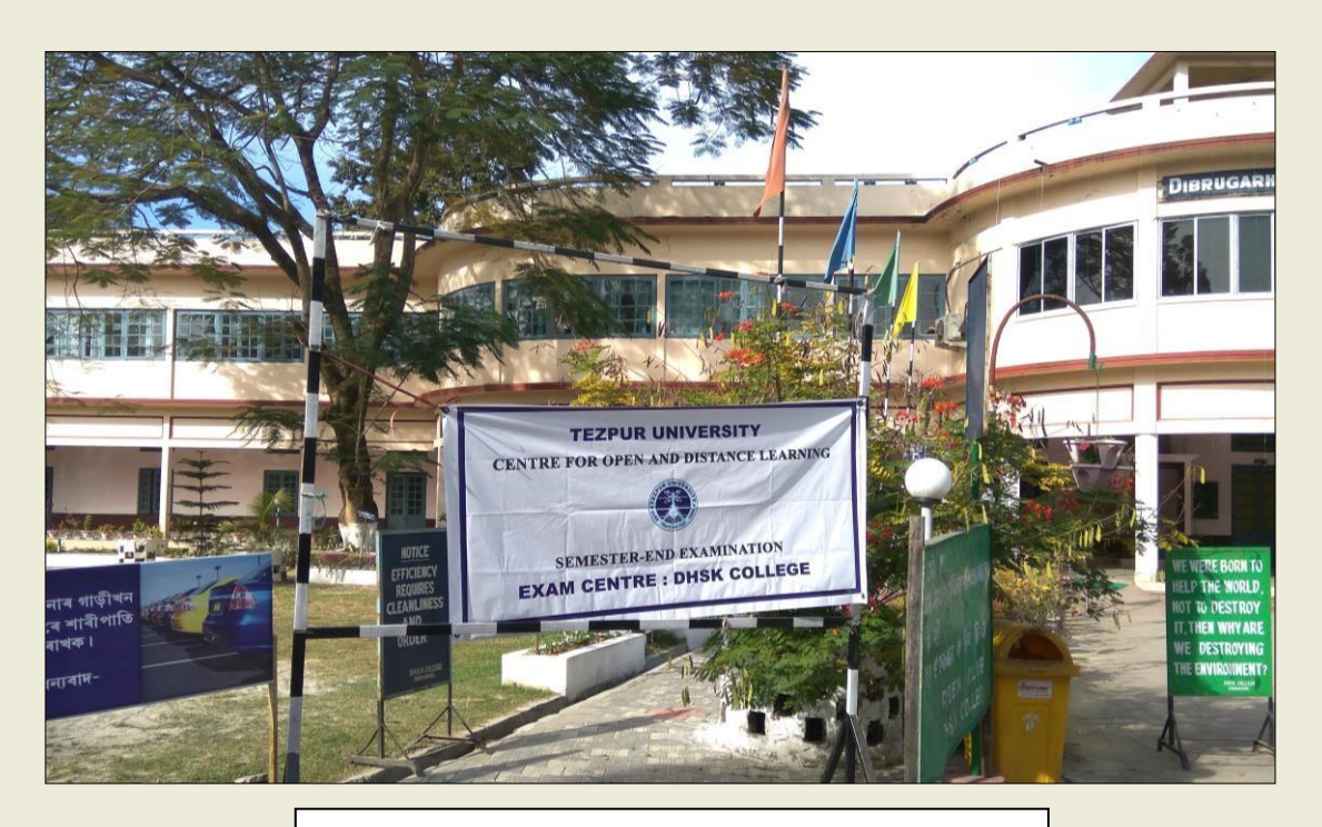
Study Centre of CODL at DHSK College, Dibrugarh