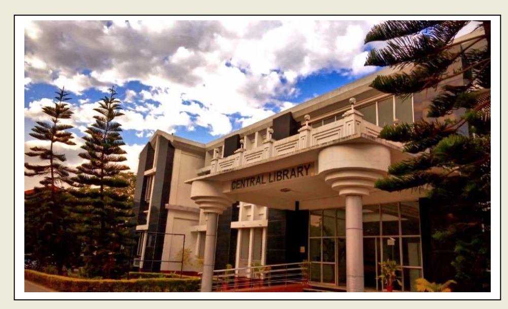
CENTRAL LIBRARY, TEZPUR UNIVERSITY