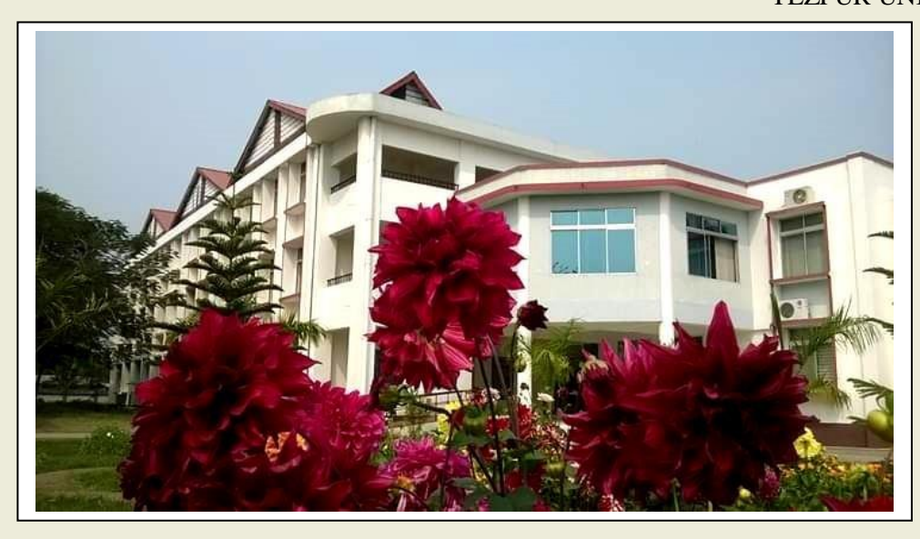
SCHOOL OF ENGINEERING, TEZPUR UNIVERSITY